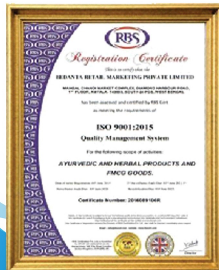
ISO 9001 : 2015