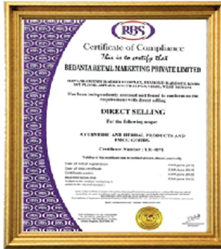
Certificate of DIRECT SELLING