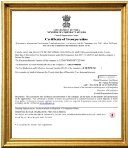
Certificate of INCORPORATION